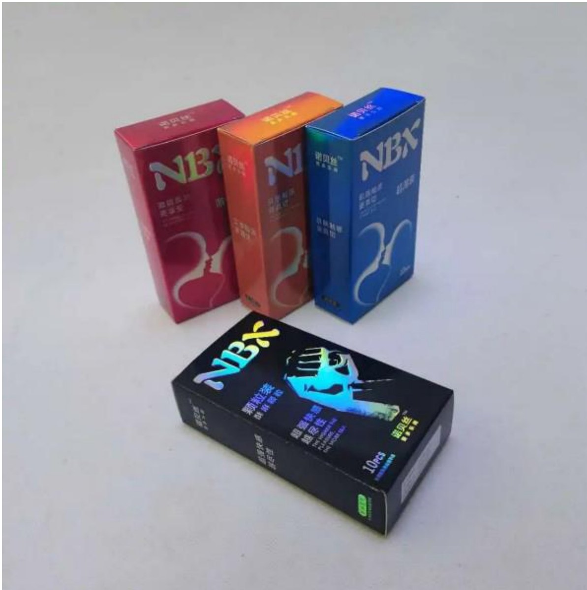
Sinst Blister Packaging Boxes for Baby Grinding Stick Process